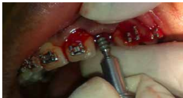
Fig. 4: Manual implant placement