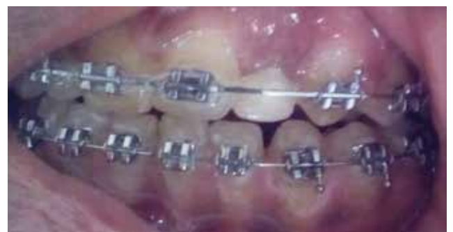
Fig. 8 & 9: Post operative follow up after 3 months showing good gingival healing.