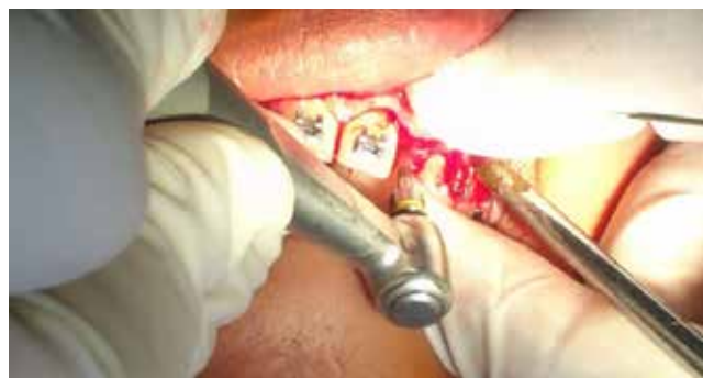
Fig. 3: Intraoperative image showing drilling