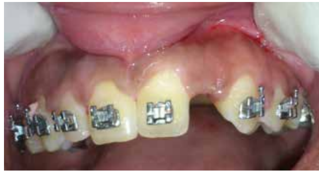
Fig. 2: Pre-operative image showing the edentulous space.