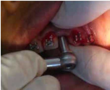
Fig. 5: Final insertion with torque ratchet.