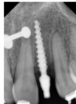
Fig. 6 & 7: Final position of implant